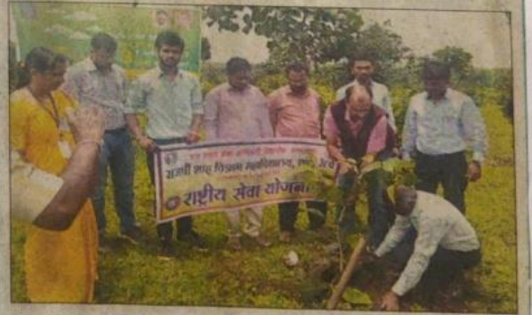
Dignitaries planting the saplings in the plantation programme.